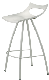
h.65 2292 VL 11

Sgabello con struttura in acciaio tubolare ø mm 22 cromato o verniciato. Disponibile in due altezze. Sedile in tecnopolimero riciclabile. Per uso interno.