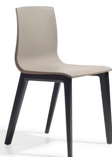
2841 FK 15

Scocca in tecnopolimero. Telaio in legno massello di faggio. Per uso interno.