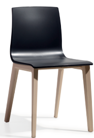
2841 FS 81