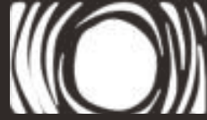
Artificial and Seminatural Trees